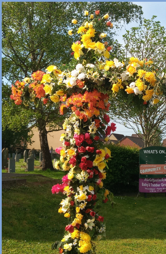
The beautifully decorated floral cross displayed outside Coxley Church for Easter 2025